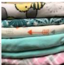
Blankets made by WinGS to share comfort with those in need

Living Water's women's group, Women in God's Service (WinGS), has been working on a care chain to help provide support to fellow members who are in need, whether it be from sickness, injury, or the like. The hope is, with members' permission, to link the care chain to that member and see what kind of help could be offered in that situation. It would be just one way that WinGS could do good to all people, especially to the family of believers (Galatians 6:10). Going forward, keep this service in mind for yourself, should you ever think you need it. It can be beneficial for both the receivers and the givers.